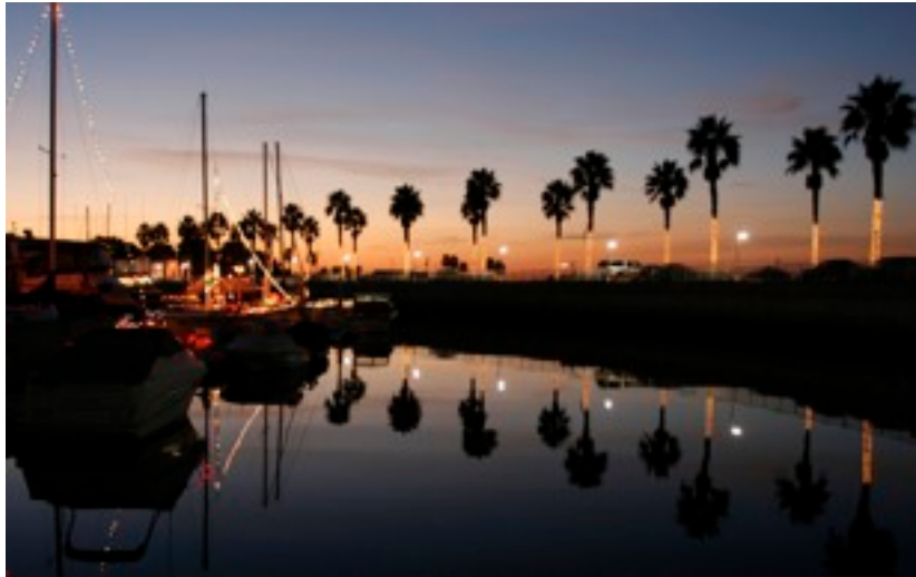
Christmas @ Loew's Coronado

If you haven't taken any boat trips, you may never have thought about marinas and their facilities, or lack thereof. There is nothing quite so fabulous as a long hot shower and given the size of our on-board shower and limited water capacity, you use the opportunity to use the marina's bathhouse. A guidebook