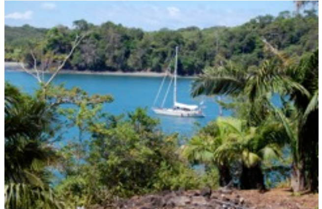
Anchored at Isla Paradita

The family had left the private island, so we pulled up anchor and wouldn't you know it... the engine quit and refused to restart...so it goes. With the Perkins manual in hand and assistance from another yacht anchored next to us "Iwa" and 'Plan B' who communicated with us via ham radio, the crew of MaaMalni learned about one more hidden bleed point on our Perkin's engine. As we all know, the British can have a very dry sense of humor, but you generally don't expect to find it in a technical manual. While reading aloud through the engine bleed instructions and carefully following each step of opening and closing various bleed points... we get to step number 8, where the manual says and I quote "Tighten the unions on both fuel pipes and the engine is ready for starting. In the unhappy event of the batteries becoming flattened during the above operation, look to your flare locker (did you check its contents before leaving port?)." It took several readings of this passage as we weren't sure if the writer meant for us to shoot a flair at the engine to get it started or was it over the side to signal for help. At this point of exasperation we would have shot the flare into the bloody engine if we thought it would have produced the desired result.