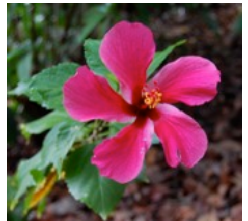
Unexpected color - Isla Paradita

Alas six hours later, we finally got 'Perky' our 87 hp Perkins up and going again, but as it was now late afternoon so we elected to stay in this beautiful little bay for yet another night. We left early the next day and sailed SW with 20+ knot winds on our port beam bound for Panama City and joining the World Cruising Club. As the sun was lowering in the west and the sky turning brilliant colors we were, once again on the lookout for fishing nets or other things that go bump... when all of a sudden this huge dark patch appears off our bow...and it was moving. What seemed at first might be a partially opened umbrella, on closer inspection turned out to be a large fin shaped as a sail... and that a sail fish was indeed sailing along using its sail... and then there was another. We never imagined that there was a reason for the name "Sailfish". And just as soon as it appeared , the pair sailed into the sunset.