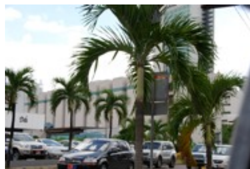
The private hospital that treated Michael